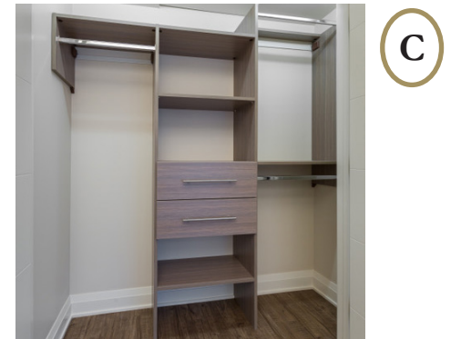
BEDROOM 2 CLOSET